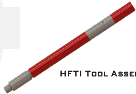
HFTI TOOL ASSEMBLY